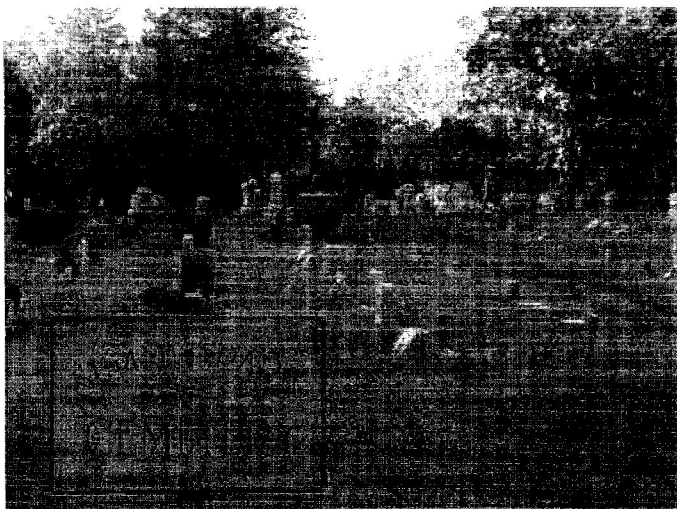
Summit Park Cemetery Inc. 800 New Hempstead Road