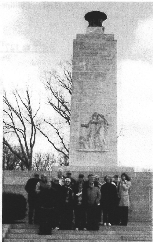
President Franklin D Roosevelt dedicated The Eternal Light Peace Memorial on Oak Hill near Gettysburg on July 3, 1938