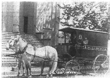
A. W. Dutcher's Sons Funeral Home

Photo taken ca. 1900 in front of Haverstraw Baptist Church